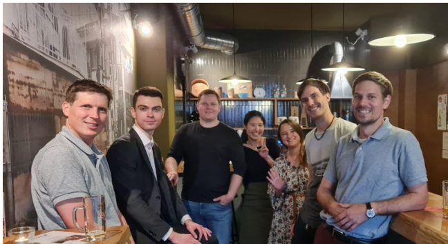
Picture 4: Joining the Monthly Meet-up of SJCC Young Professionals

During the first six months in Switzerland, I have found many amazing places and experienced fun activities in Switzerland through friends, acquaintances, and my partner.